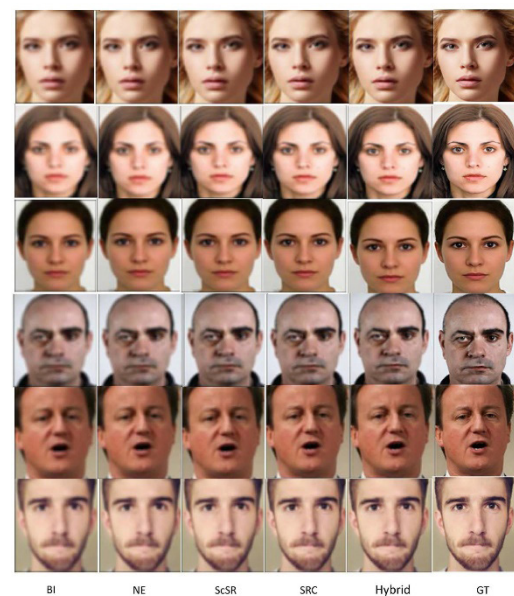
Figure 2: Results of images with different algorithms.

We choose a Bicubic method, the NE algorithm, the ScSR algorithm and the SRCNN algorithm for comparative test. We evaluate and compare the performance of our proposed models in terms of peak signal to noise ratio (PSNR) and structure similarity (SSIM). The model is tested on 500 images of BANVA dataset. Here are the visual qualities of the face hallucination results generated by our method and other competing ones in Figure 2.