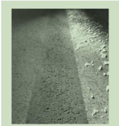
Figure 3: Anti-icing effect

It can be seen from Figure 3 that there is no icing phenomenon in the road section where the sand mist seal layer is implemented. However, there is still ice on the road that has not been implemented. It can be proved that the resin-based sand mist sealing material of Thelma has a certain anti-icing effect. To a certain extent, the safety hazards of winter test driving can be eliminated.