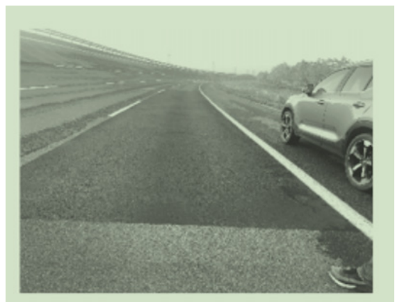
Figure 2: Photo after preventive maintenance